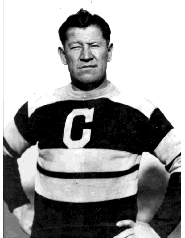
The Legendary Jim Thorpe

While the Bulldogs are no longer around, pro football remembers its early days in Canton, Ohio. Visitors, young and old, enjoy the story of pro football's history in the city where the NFL began!